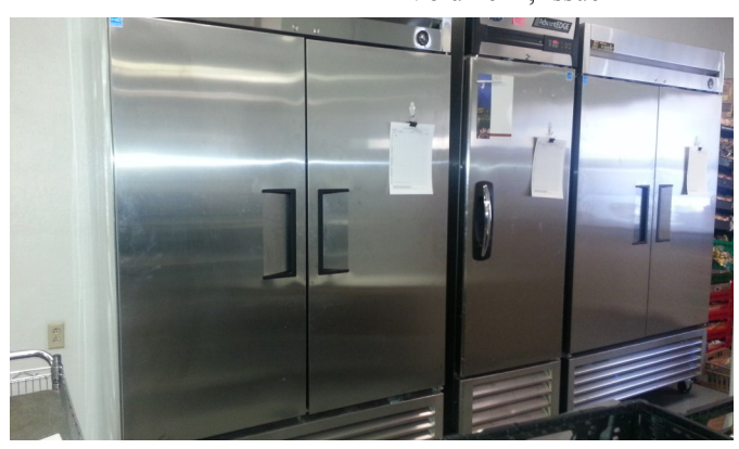
Photo above: commercial freezers in the box prep area. Photo right: The new food storage area. Photo below: new stainless steel tables and a fresh coat of paint in our food box prep area.